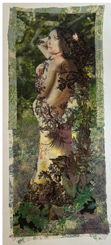
Demi Moore (actress) as a tree (after Cranach the Elder) on an assemblage of brown, green and blue canvases).2017. Single inkjet print on printed fabric, thread. Collection of Tim Hailand

The exhibition presents : Emblematic works that illustrate the different steps of his artistic exploration, since his first